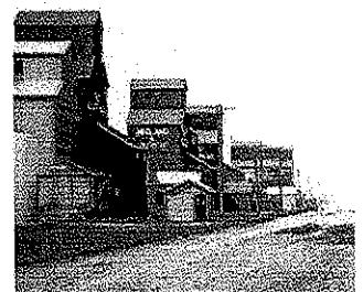
Our Disappearing Landscape

HOURS : Seasonal Opening: May Long Weekend 1- 4 pm. June: 1- 4 pm Sundays. July & August: 10 - 4 pm Wednesday to Saturday. 1 - 4 pm Sundays. September: 1- 4 pm Sundays.